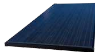
BlackBlack Also available with black backsheet and frame