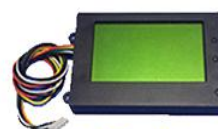
LCD with box