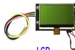
LCD without box